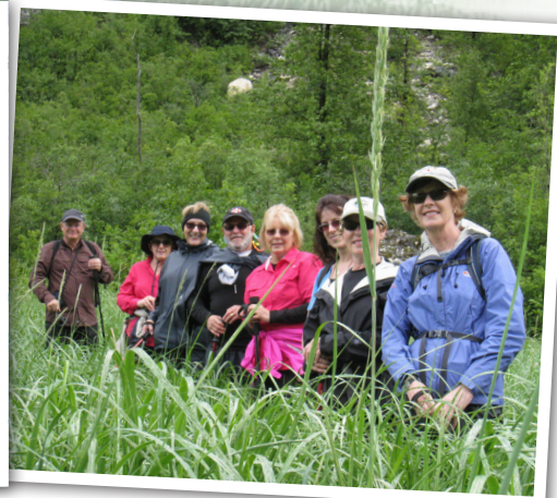
Bushwhack at Cape Fanshaw