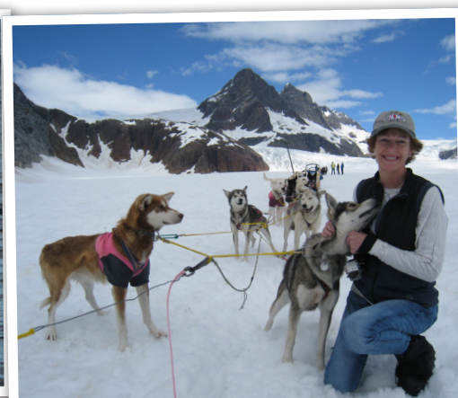
Dog Sledding on Taku Glacier