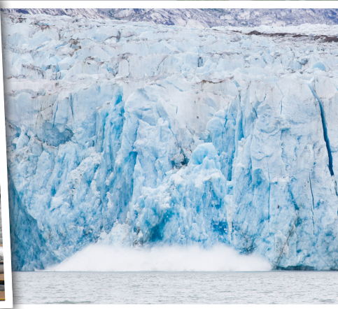
Calving at Dawe's Glacier