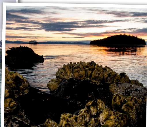
'Sunset - Icy Strait'