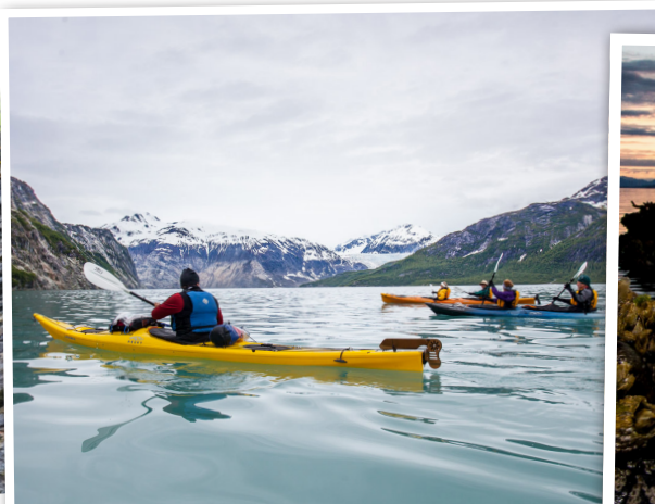
Kayaking at Chichagof Island