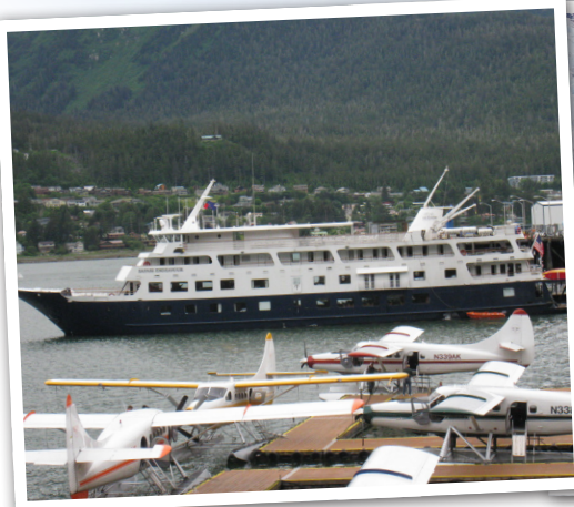
Safari Endeavour & Seaplane