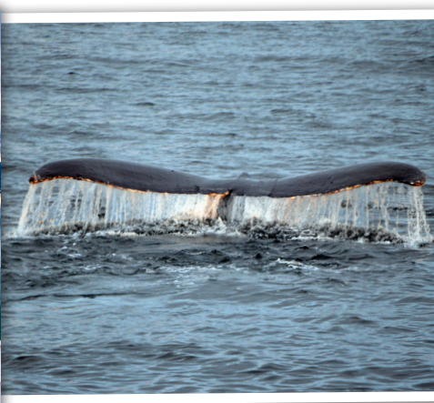
Humpbacks hunting for a feed